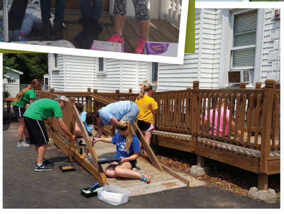
A team of students refinished our wheelchair ramp.